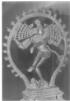
Chola Bronze Nataraja

The Dravidian style of art and architecture reached its perfection under the Cholas. They built enormous temples. The chief feature of the Chola temple is the vimana. The early Chola temples were found at