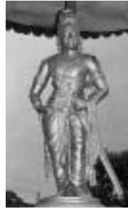
STATUE OF RAJARAJA