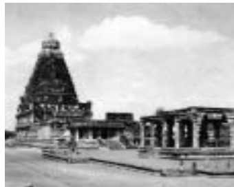
Pragadeeswara Temple, Tanjore

Narthamalai and Kodumbalur in Pudukottai district and at Srinivasanallur in Tiruchirappalli district. The Big Temple at Tanjore built by Rajaraja I is a master-piece of South Indian art and architecture. It consists of the vimana , ardhamandapa , mahamandapa and a large pavilion in the front known as the Nandimandapa . Another notable contribution made by the Cholas to temple