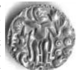
GOLD COIN OF RAJARAJA CHOLA

Both Saivism and Vaishnavism continued to flourish during the Chola period. A number of temples were built with the patronage of Chola kings and queens. The temples remained centres of economic activity during this period. The mathas had great influence during this period. Both agriculture and industry flourished. Reclamation of forest lands and the construction and maintenance of irrigation tanks led to agricultural prosperity. The weaving industry, particularly the silk-weaving at Kanchi flourished. The metal works developed owing to great demand of images for temples and utensils. Commerce and trade were brisk with trunk roads or peruvazhis and merchant guilds. Gold, silver and copper coins were issued in plenty at various denominations. Commercial contacts between the Chola Empire and China, Sumatra, Java and Arabia were extensively prevalent. Arabian horses were imported in large numbers to strengthen the cavalry.