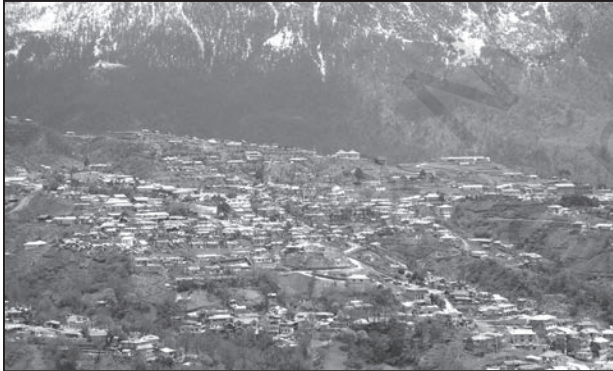
Fig. 2.1 : Clustered Settlements in the North-eastern states

The clustered rural settlement is a compact or closely built up area of houses. In this type of village the general living area is distinct and separated from the surrounding farms, barns and pastures. The closely built-up area and its