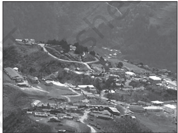
Fig. 2.2 : Semi-clustered settlements

Semi-clustered or fragmented settlements may result from tendency of clustering in a restricted area of dispersed settlement. More often such a pattern may also result from segregation or fragmentation of a large compact village. In this case, one or more sections of the village society choose or is forced to live a little away from the main cluster or village. In such cases, generally, the land-owning and dominant community occupies the central part of the main village, whereas people of lower strata of society and menial workers settle on the outer flanks of the village. Such settlements are widespread in the Gujarat plain and some parts of Rajasthan.