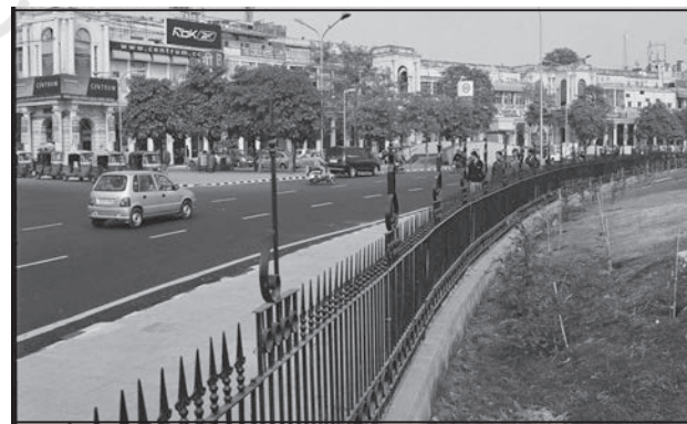
Fig. 2.4 : A view of the modern city

The British and other Europeans have developed a number of towns in India. Starting their foothold on coastal locations, they first developed some trading ports such as Surat, Daman, Goa, Pondicherry, etc. The British later consolidated their hold around three principal nodes – Mumbai (Bombay), Chennai (Madras), and Kolkata (Calcutta) – and built them in the British style. Rapidly