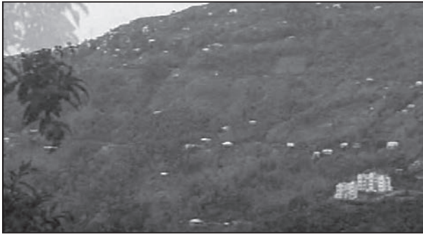
Fig. 2.3 : Dispersed settlements in Nagaland

with farms or pasture on the slopes. Extreme dispersion of settlement is often caused by extremely fragmented nature of the terrain and land resource base of habitable areas. Many areas of Meghalaya, Uttarakhand, Himachal Pradesh and Kerala have this type of settlement.